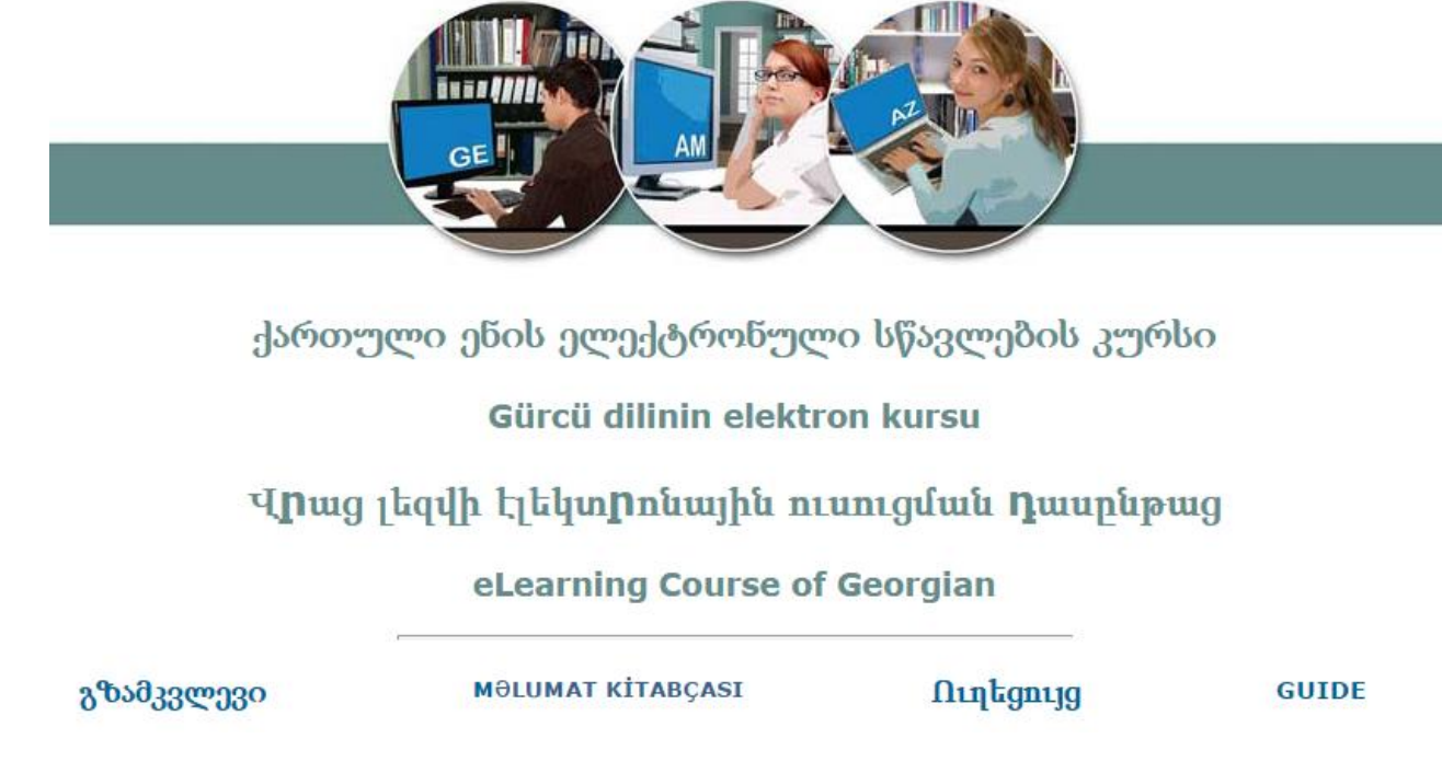
Figure 2. eLecture for Georgian Language.

Sweden). A target learner group are Georgian citizens who speak Azerbaijani or Armenian as their first language. The topic structure of the program syllabi represents the program creators' presumptions about possible difficulties of the learner. The topics are not confirmed based on empirical evidence, despite the fact that the emphasis of any specific subject matter must be strengthened oriented on the errors made by learners in the real learning process.